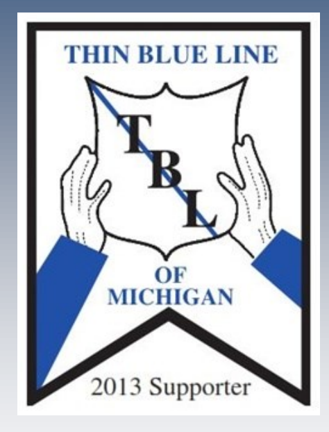
Voluntarily Employee Supported Program

Objective 4: Objective review started, not fully analyzed. Virtual equipment consolidation and strategies requires collaboration with partner communities. SERESA did enter into an agreement with Macomb County in 2017 for the purposes of recording radio talk-groups, which is a step toward this objective.